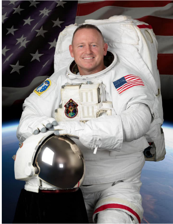
Barry "Butch" Wilmore NASA Astronaut, Captain, United States Navy

Tennessee native Barry E. Wilmore (Captain, U.S. Navy, Ret.) was born in Murfreesboro and raised in Mt. Juliet. Selected by NASA as an astronaut in 2000, he is a veteran of three spaceflights and has accumulated a total of 464 days in space. As part of Expedition 41, he served as flight engineer aboard the International Space Station, and then as commander of Expedition 42 which led to 167 days in space. During Expedition 72, as part of NASA's SpaceX Crew-9 crew, Wilmore completed a spacewalk with NASA astronaut Suni Williams, leading him to have logged over 32 hours of time in five spacewalks. A U.S. Navy combat veteran, he has accumulated more than 8,000 flight hours and 663 carrier landings, all in tactical jet aircraft, and is a graduate of the United States Naval Test Pilot School. He flew missions in support of Operations Desert Storm, Desert Shield and Southern Watch over the skies of Iraq, as well as missions over Bosnia in support of United States and NATO interests. He is a graduate of Tennessee Technological University and the University of Tennessee, Knoxville.